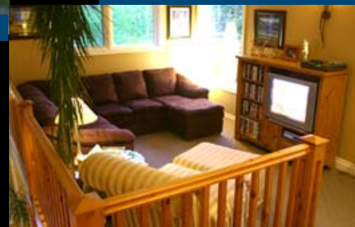
Lofted TV Room