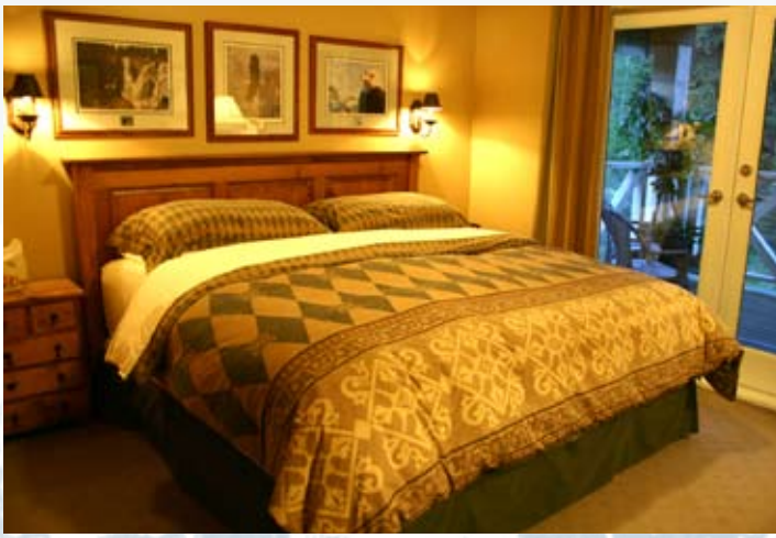
5 Bedrooms/3 Full Bathrooms