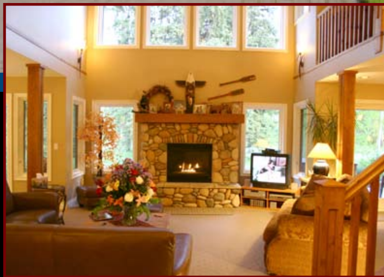
Central Rock Gas Fireplace

A modern fully equipped home for mixed group and multiple family use, excellent group configuration.