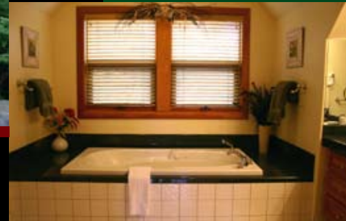
Jacuzzi Soaker Tub