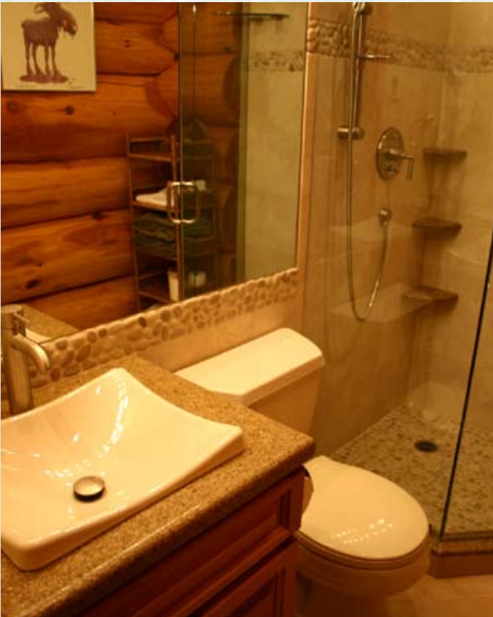
3 Full Bathrooms