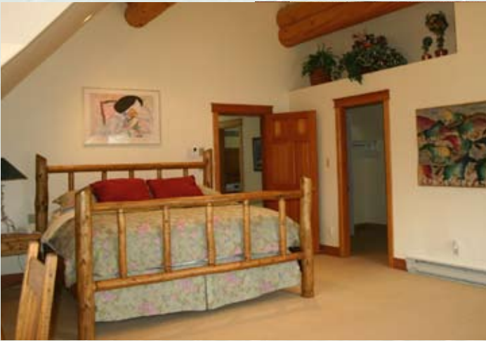
King Bed with Open High Lofted Ceilings