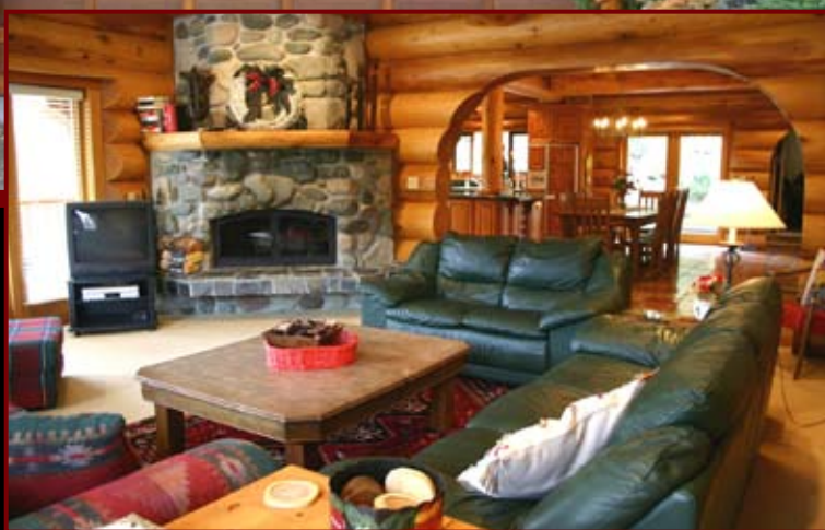
Central Wood Burning Rock Fireplace