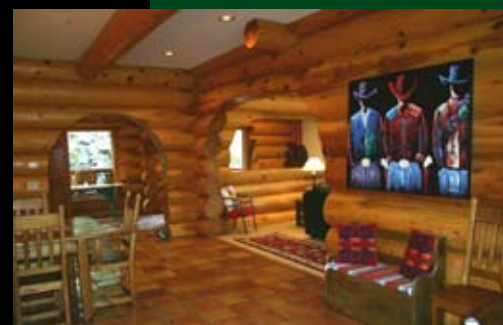
Dining for 10