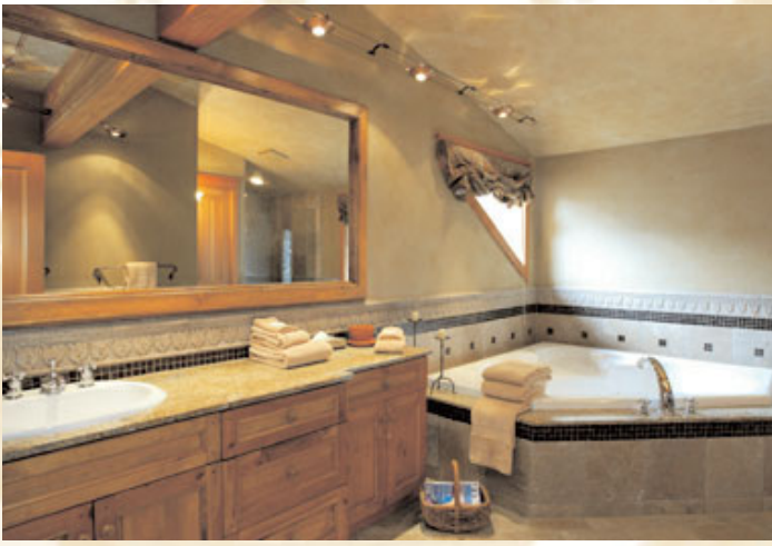
En-suite Bathroom with Sunken Bath