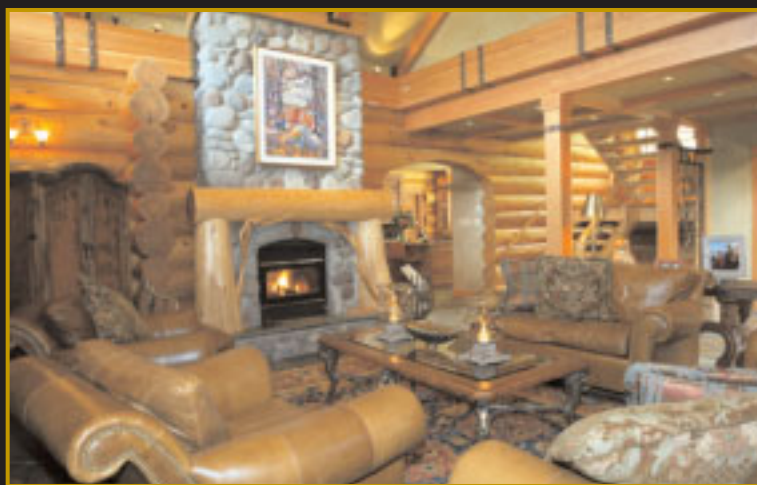
Living Room with Dual-sided Central Woodburning Fireplace