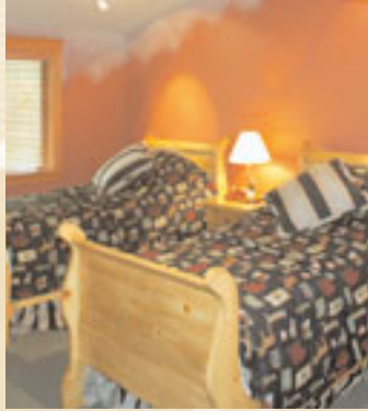
Custom Brocade Bedding