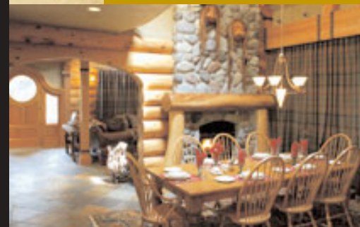
Dining Room with Fireplace