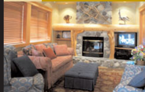
Second TV Lounge Room