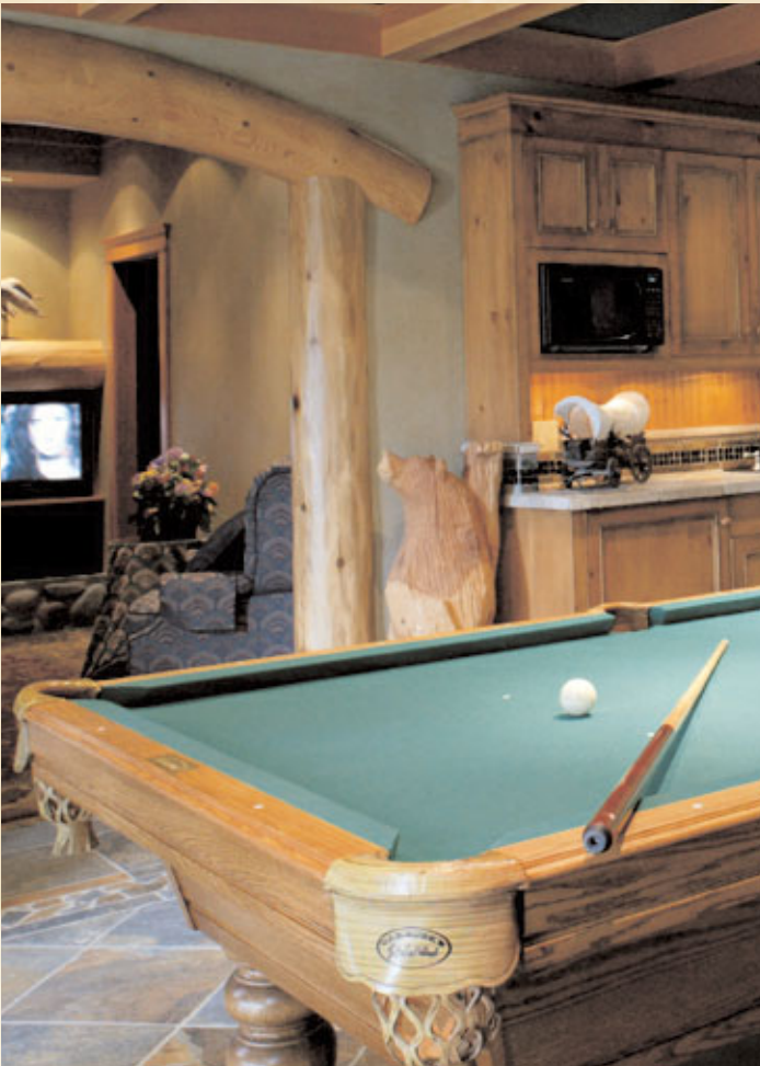
Regulation Size Pool Table