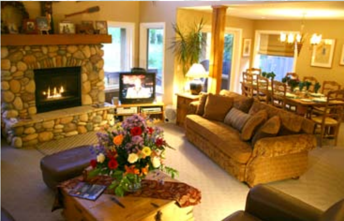
Spacious High Ceiling Rooms