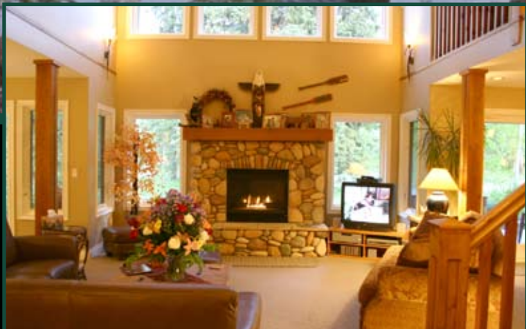
Central Rock Gas Fireplace