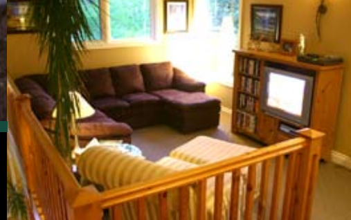
Lofted TV Room