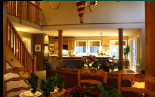
Open Living/Dining Area