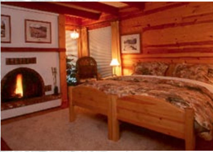
Twin to King Bedroom with Fireplace