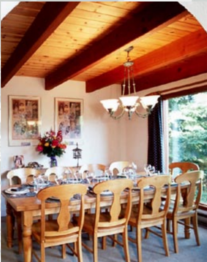
Alcove Entrance to Dining Room for 10