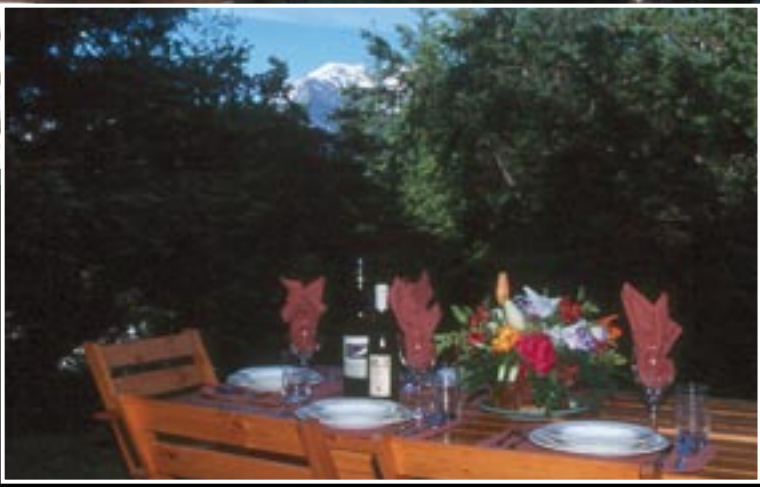
Private Backyard Setting