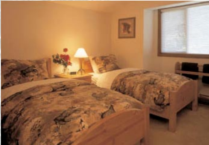
Twin to King Beds